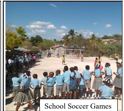
School Soccer Games

“You are my shelter; you guard me from distress; with joyful shouts of deliverance you surround me...Be glad in the LORD and rejoice, you righteous; exult, all you upright of heart. –Psalm 32: 7,11