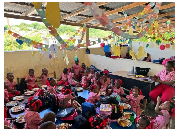
Lunch for the Kinder class