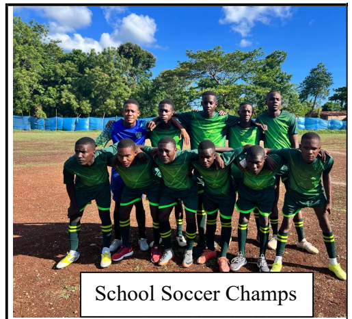
School Soccer Champs

In every way I have shown you that by hard work of that sort we must help the weak, and keep in mind the words of the Lord Jesus who himself said, 'It is more blessed to give than to receive.' –Acts 20:35