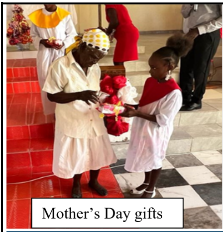
Mother's Day gifts